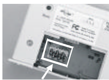
Code Connectors on Receiver

Each receiver can work with up to 4 different sensors (to represent 4 different zones on the receiver). Please refer to the user's instructions of the sensor to set the zone. If the sensor is set to zone 1, the receiver zone 1 signal will correspond to this sensor.