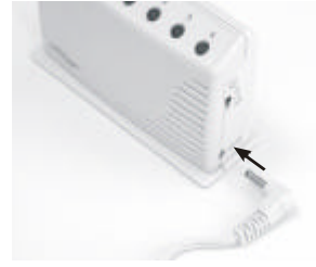
Plug in the adapter to the receiver

Activate each Household Alert® sensor, this will program the sensor to the receiver.